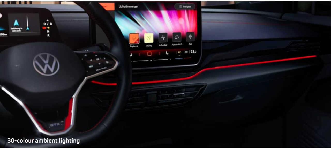
30-colour ambient lighting

Discover the optional upgrades for you. Discover more at volkswagen.ie