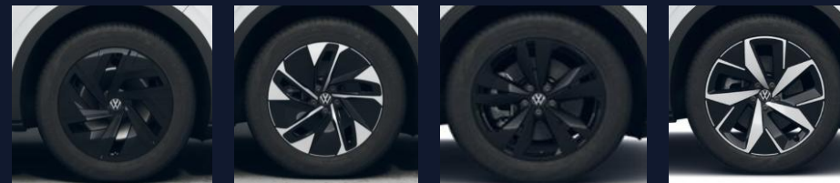
19" Steel Wheels