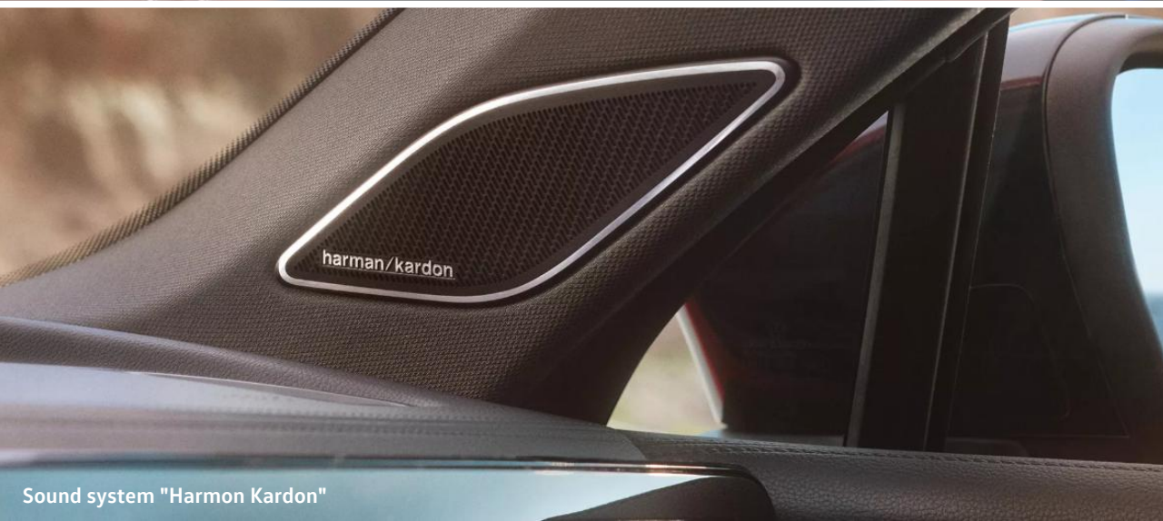
Sound system "Harmon Kardon"