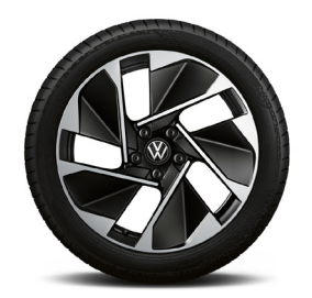
STANDARD ON ID.3 Pro 18" 'East Derry' alloy wheels 7.5J x 18 Tyres: 215/55 R18