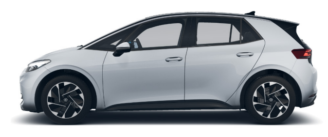
Scale Silver Metallic*