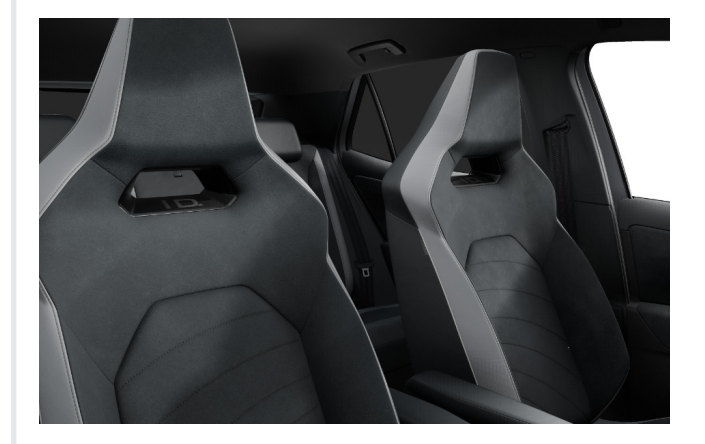
Artvelour Seats - Top sports seats Soul-Artvelour eco Option on ID.3 Pro & Pro S with Interior Plus Package