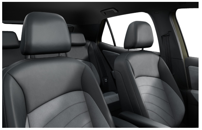
Artvelour Seats Dusty Grey/Dark Soul Black Standard on ID.3 Pro S - option on Pro with Interior Package