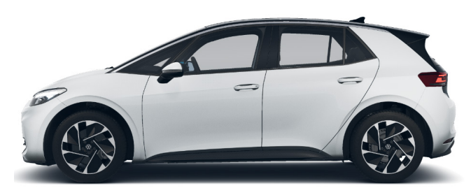
Glacier White Metallic*