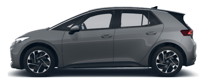
Moonstone Grey Solid