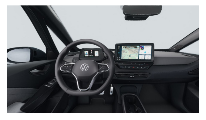
Standard on ID.3 Pro S Dusty Grey Dark stitching Crystalgrey