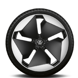
OPTIONAL ON ID.3 Pro S 20" 'Sanya' alloy wheels 7.5J x 20 Tyres: 215/45 R20