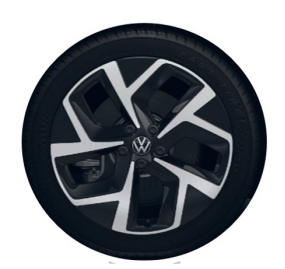
STANDARD ON ID.3 PRO S 19" 'Andoya' alloy wheels 7.5J x 19 Tyres: 215/50 R19