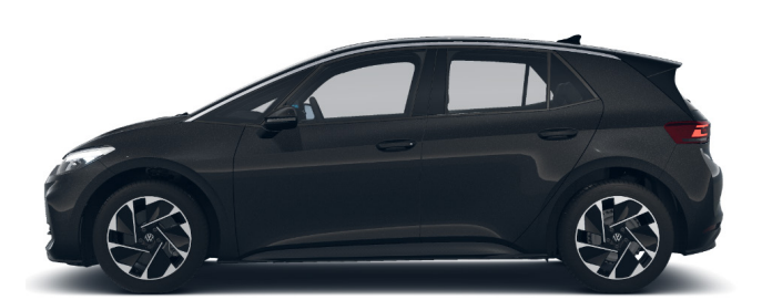
Mythos Black Metallic*