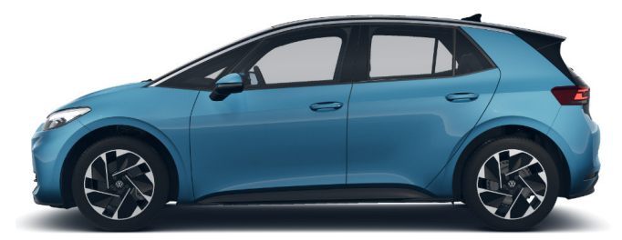
Costa Azul Metallic*