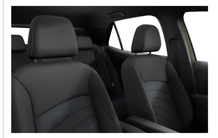
"Taia" Fabric seats Grey-Melange Taia/Soul Black Standard on ID.3 Pro