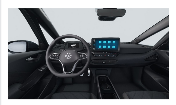
Standard on ID.3 Pro Soul stitching Crystalgrey