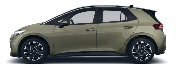
Dark Olivine Green Metallic*